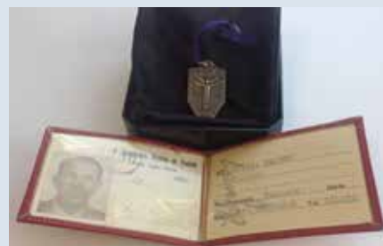
World Cup medal and official pass card