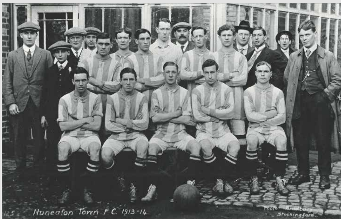
125 Nuneaton Town F.C. 1913-14